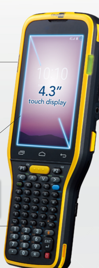
29/38/52 keypad options. Terminal Emulation keypads support TN and VT systems.

4.3" touch display ensures readability and future adoption of touch-based applications.